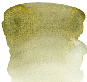
VAN GOGH 230 G DUSK YELLOW