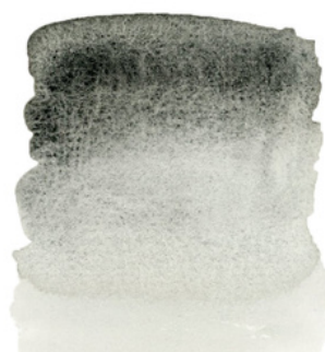
Rembrandt 735 OXIDE BLACK