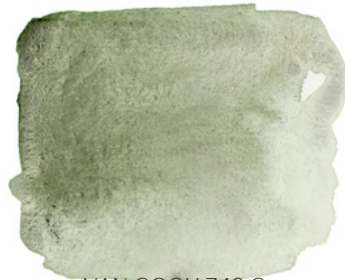
VAN GOGH 748 G DAVY'S GREY