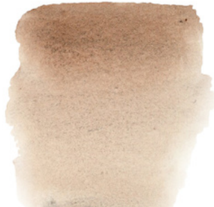
DANIEL SMITH HEMATITE BURNT