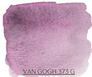
VAN GOGH 373 G DUSK Pink