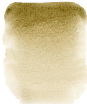
DANIEL SMITH TIGER'S EYE