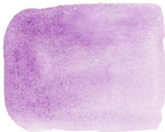
Schminke 474 Manganviolet