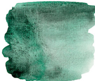
REMBRANDT 630 G DUSK GREEN