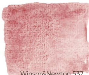
Winsor&Newton 537 Potters Pink