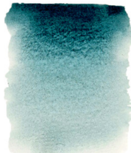
DANIEL SMITH BLUE APATITE