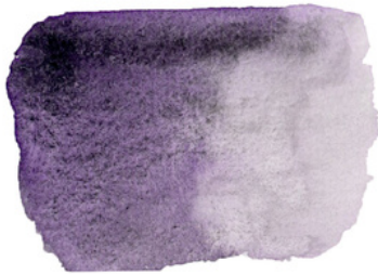
VAN GOGH 560G DUSK VIOLET